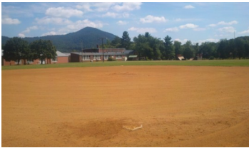
The view from home plate.

Our baseball field is finally being used! In mid-August, the Baseball Team Nelson 18U came to us in need of a place to practice and play. RVCC happily partnered with this team to restore our ball field, and it's been truly amazing how much this group of parents and volunteers have accomplished in a few short weeks. The crew has skimmed and leveled the infield, built a pitcher's mound, installed bases, and fired up the malfunctioning lights on the west side of the field.